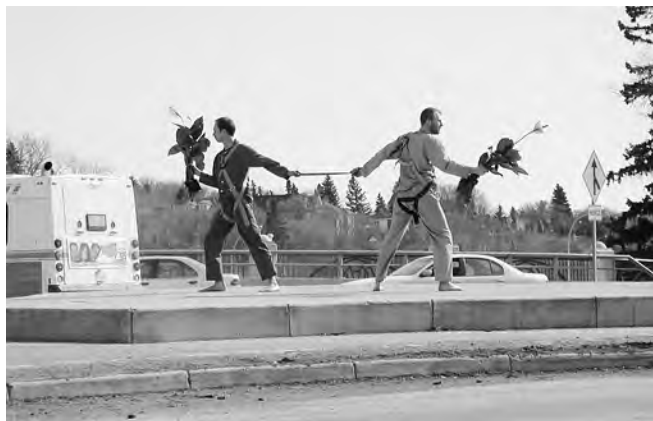
April 10, 2003 / Performance Enhancing Series AKA Gallery @ intersection at the foot of University Bridge, Saskatoon, Canada