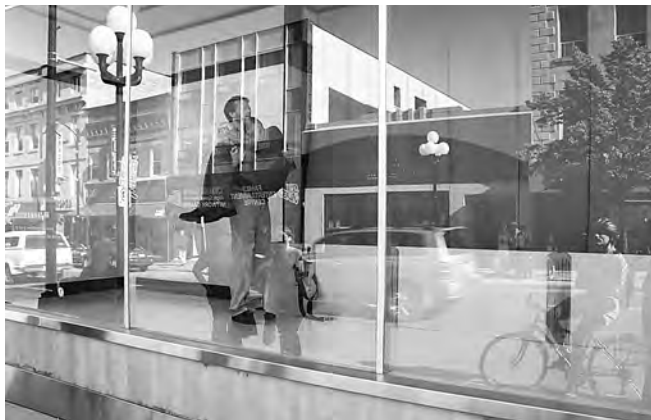
June 15, 2003 / Art on the Streets Modern Fuel @ 176 Princess Street, Kingston, Canada