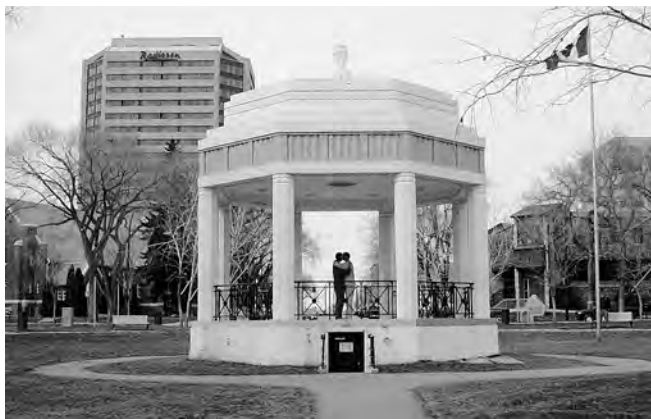
April 11, 2003 / Performance Enhancing Series AKA Gallery @ Vimy Gazebo, Saskatoon, Canada