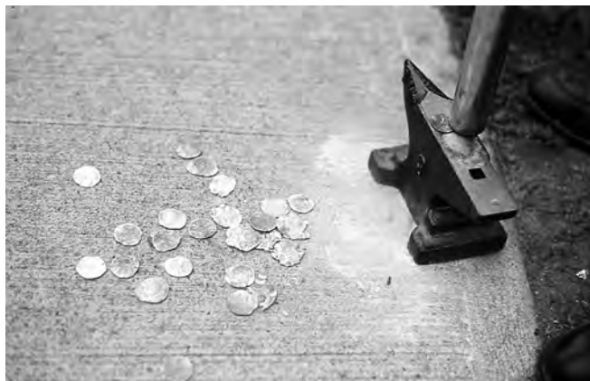
August 15, 2003 / sevensession Art Gallery of Hamilton @ Staircase Theatre, Hamilton, Canada