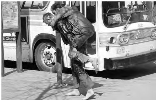
April 10, 2003 / Performance Enhancing Series AKA Gallery @ bus mall, Saskatoon, Canada