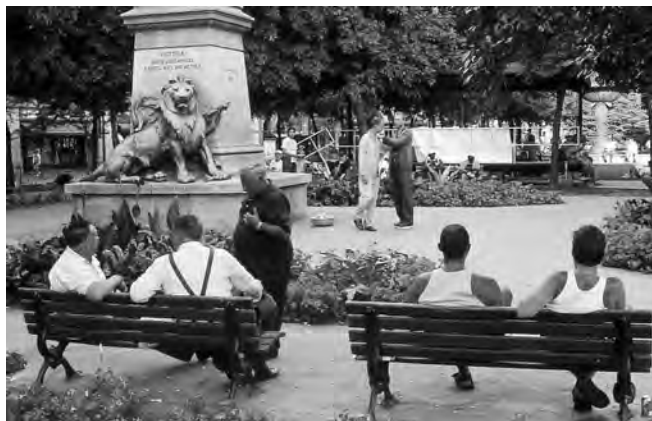
August 14, 2003 / sevensession Art Gallery of Hamilton @ Jackson Square, Hamilton, Canada