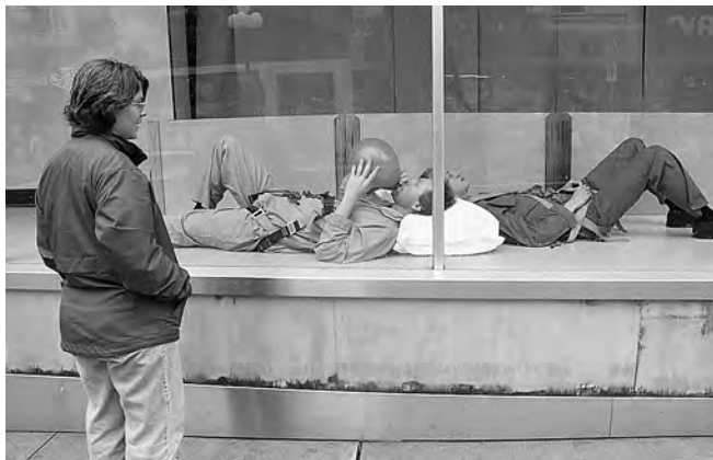
June 13, 2003 / Art on the Streets Modern Fuel @ 176 Princess Street, Kingston, Canada