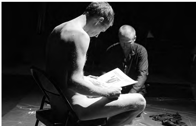
December 3, 2004 / eBent 04 , Centre de Cultura Contemporània de Barcelona, Barcelona, Spain