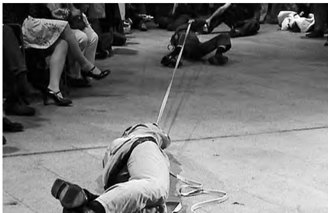
December 4, 2004 / eBent 04 , La Casa Encendida, Madrid, Spain