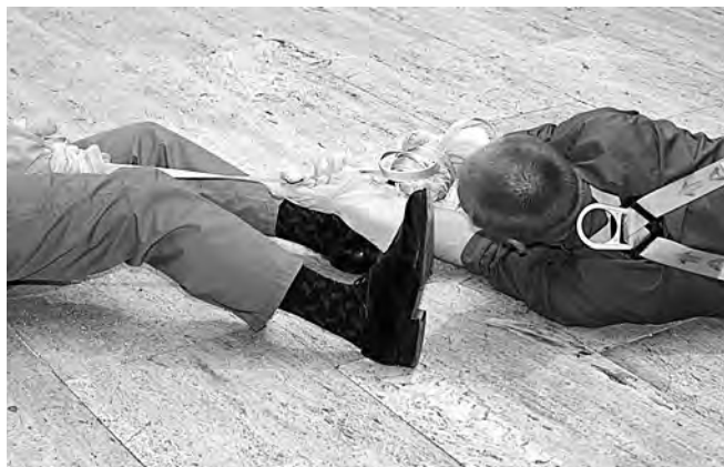
December 3, 2004 / eBent 04 Centre de Cultura Contemporània de Barcelona, Barcelona, Spain