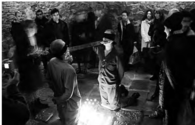
December 2, 2004 / eBent 04 , La Interior Bodega, Barcelona, Spain