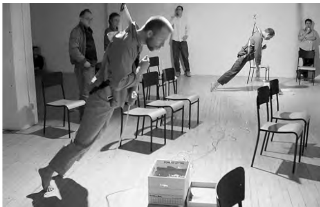
April 11, 2003 / Performance Enhancing Series , AKA Gallery, Saskatoon, Canada