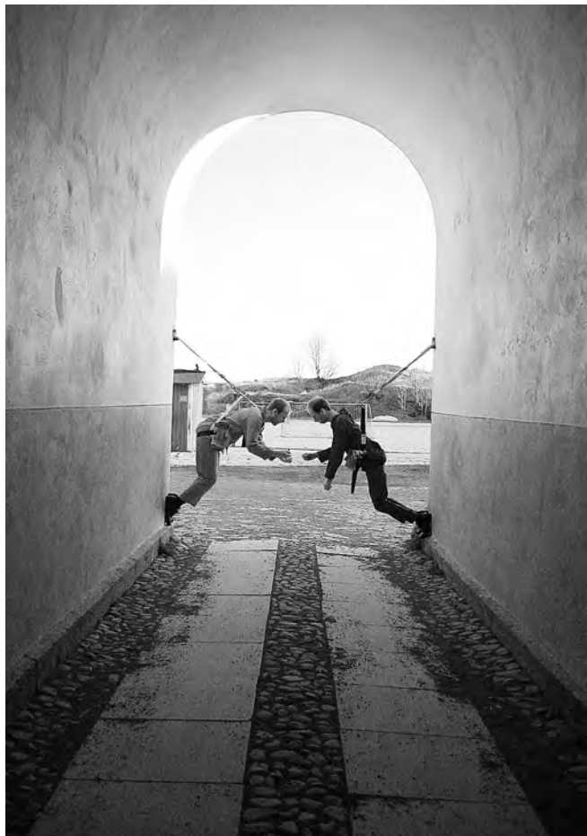
April 23, 2004 / Space Contentions Studio Là-bas @ Galleria Augusta, Suomenlinna Island, Helsinki, Finland