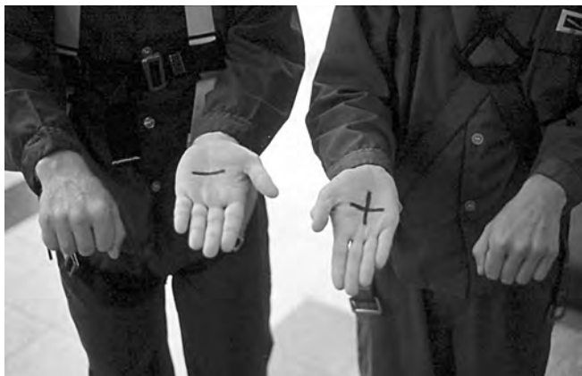
August 13, 2003 / sevenseason Art Gallery of Hamilton @ Famous Players Cinemas, Jackson Square, Hamilton, Canada