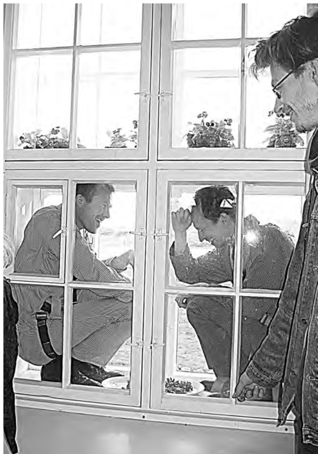
April 23, 2004 / Space Contentions Studio Là-bas @ Galleria Augusta, Suomenlinna Island, Helsinki, Finland