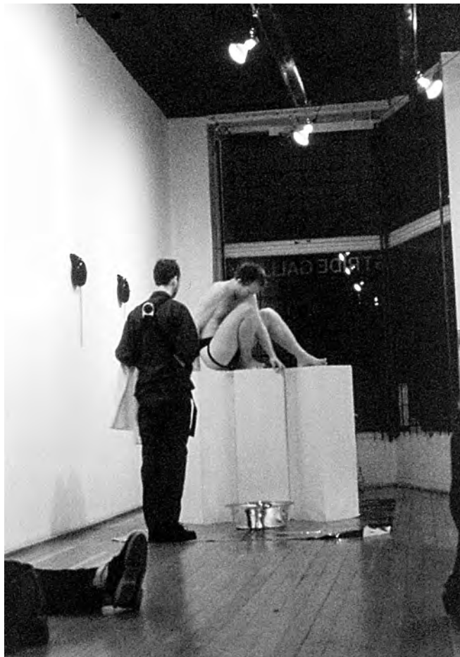
April 21, 2001 / Mountain Standard Time Festival (M:ST) Stride Gallery, Calgary, Canada