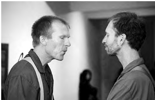
September 10, 2000 / 8th Castle of the Imagination Performance Art Festival Galeria Bielska BWA, Bielsko Biala, Poland