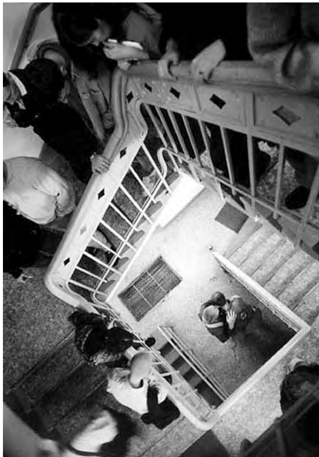
September 6, 2000 / 8th Castle of the Imagination Performance Art Festival Centre for Contemporary Art Laznia, Gdansk, Poland