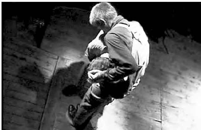
September 14, 2000 / Fort Sztuki 2000 , Teatr Sytuacji, Krakow, Poland