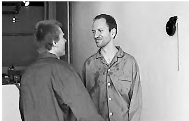
April 19, 2001 / Mountain Standard Time Festival (M:ST) Stride Gallery, Calgary, Canada