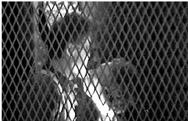
August 4, 2001 / VisualEyez Festival Latitude 53 @ Whyte Avenue, Edmonton, Canada