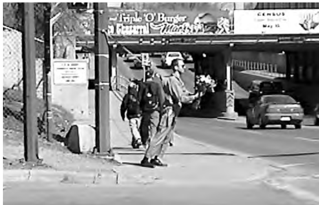
April 17, 2001 / Mountain Standard Time Festival (M:ST) → Macleod Trail South & 10 Avenue, Calgary, Canada