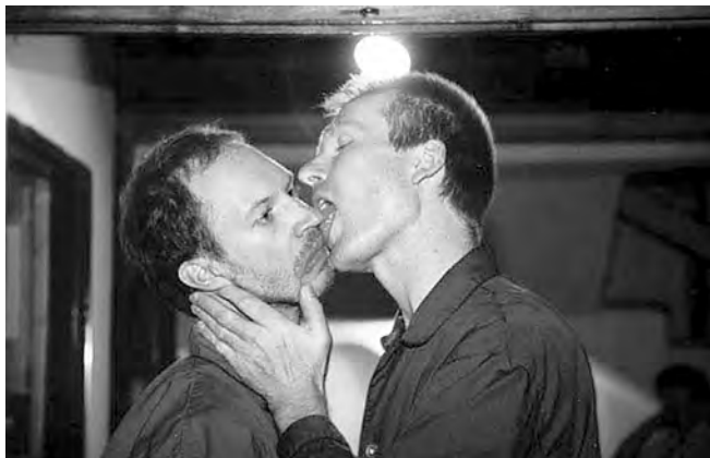
September 1, 2000 / 8th Castle of the Imagination Performance Art Festival Baltic Art Gallery, Ustka, Poland