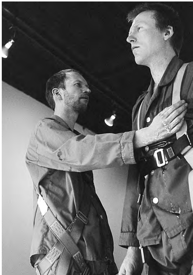
April 20, 2001 / Mountain Standard Time Festival (M:ST) Stride Gallery, Calgary, Canada