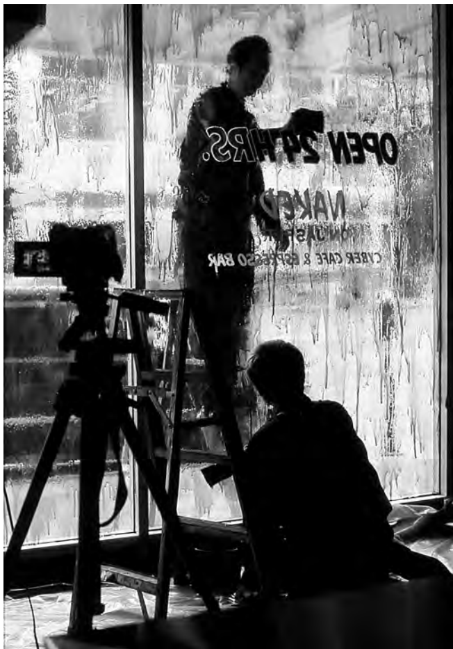
August 4, 2001 / VisualEyez Festival Latitude 53 @ Naked Cyber Cafe, Edmonton, Canada