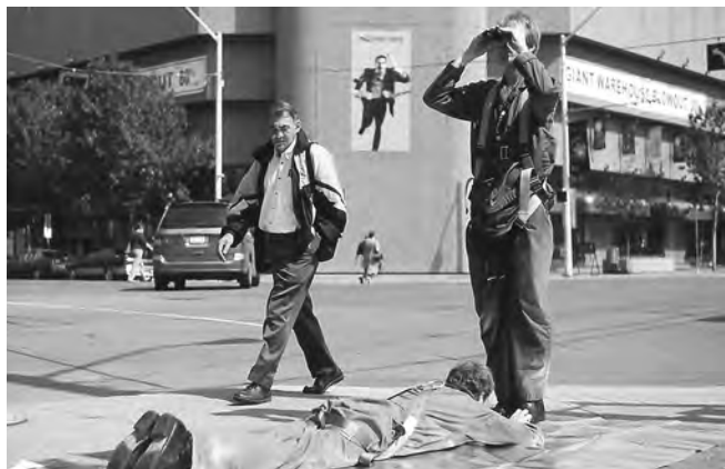
August 5, 2001 / VisualEyez Festival Latitude 53 @ downtown streets, Edmonton, Canada