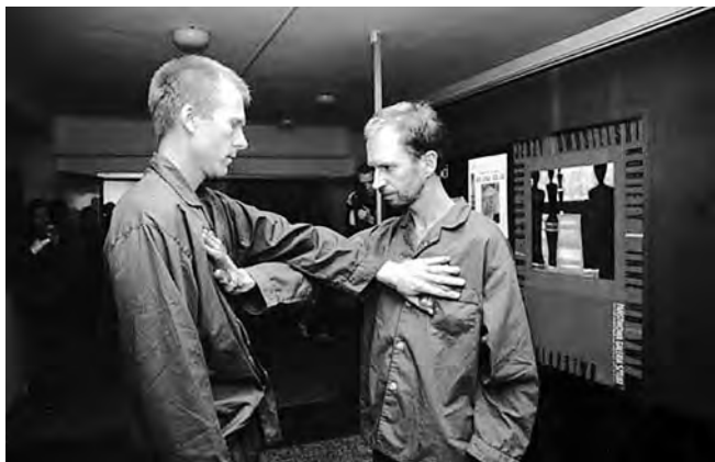
September 4, 2000 / 8th Castle of the Imagination Performance Art Festival State Art Gallery, Sopot, Poland