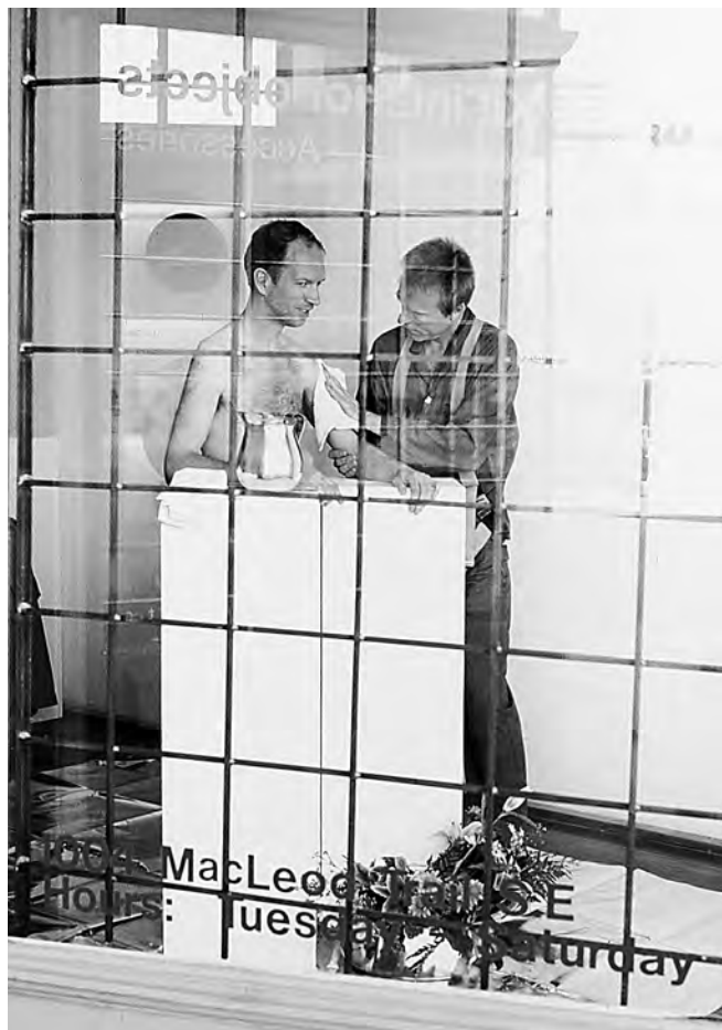
← April 18, 2001 / Mountain Standard Time Festival (M:ST) Stride Gallery, Calgary, Canada